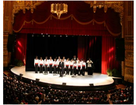
The Cornerstone Concert Choir on stage at the Fox Theatre on January 8th for the inauguration of Detroit Mayor Dave Bing.