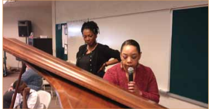
Jazz musicians share their talents in a fun lesson on the physics of sound