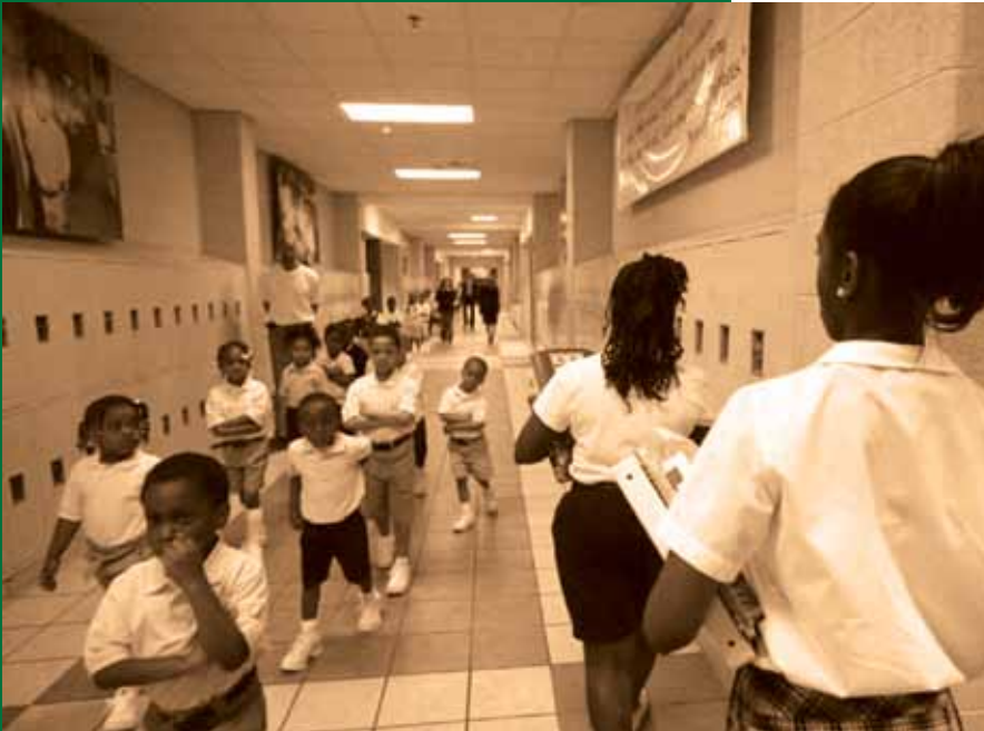
Students make their way to classes at Detroit's Cornerstone School in May 2009

This was long before the explosion of charter schools in the city, and way before the Skillman Foundation began its Excellent School Detroit effort to identify and promote high-performing schools. This was well before most people were even open to the idea that urban education might best be structured through many alternatives and options. So in that sense, Cornerstone and